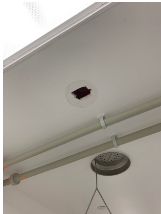
Outside Room 1099