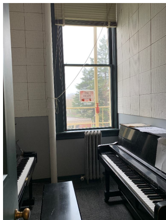
H306 Room E