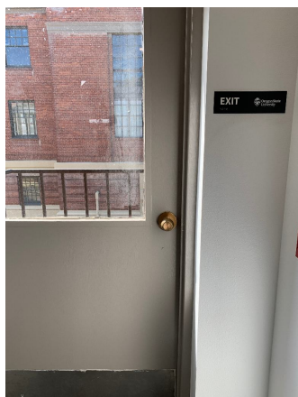
Second Floor West Exit