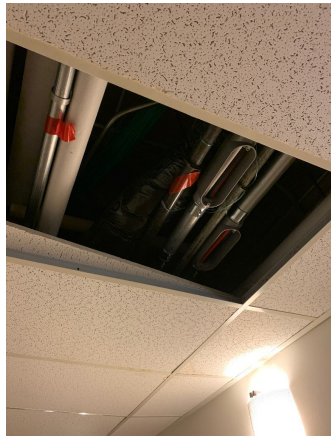
Cover plate outside 138