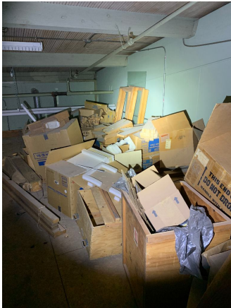
East side south attic mezzanine

2 Storage of materials in buildings shall be orderly and stacks shall be stable. 2019 OFC 315.3 SE:Mezzanine DEPT Storage of combustible materials shall be stacked in an orderly manner. Remove excess combustible boxes and rubbish from space.