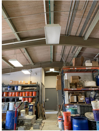
Exit sign needed