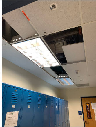
4th Floor Clean Room