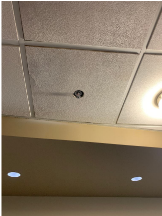
Outside suite 321.

Missing sprinkler sleeve and paint on sprinkler head.