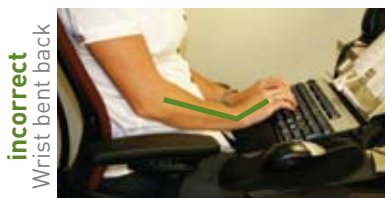
incorrect Wrist bent back

Use a soft palm rest to minimize contact pressure with hard surfaces on the desk. It is important to use these pads for periodic "micro breaks" and not as a means of support while typing.