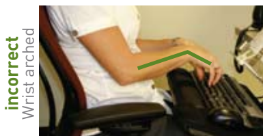
incorrect Wrist arched