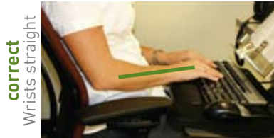
correct Wrists straight

Verify that the seat pan width is adequate by making sure that there are 1-2 inches (or two finger widths) of space between the thigh and the chair edge.