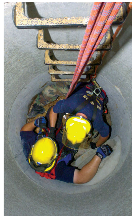
Experienced emergency responders must be available if an entrant needs help.

The rescue team must have access to the space before the entry because they need to develop a rescue plan and practice before the actual entry. If the team has access to a space similar to the one that needs to be entered, they can use that space for the practice rescue instead.