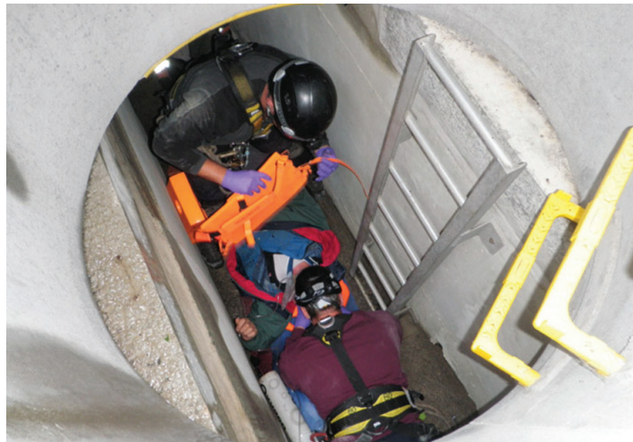
Third-party rescue services must be capable of performing all necessary rescue operations.