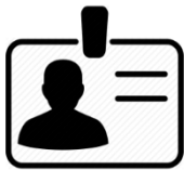
ID BADGE REQUIRED