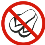
NO OPEN TOE OR OPEN HEEL SHOES