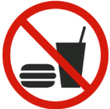
NO FOOD OR DRINK