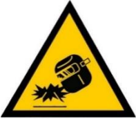
HOT WORK AREA