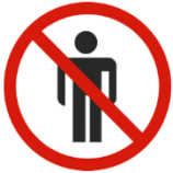
AUTHORIZED PERSONNEL ONLY